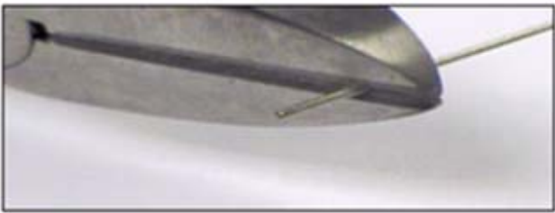
1A. Cut tube within 1/2" from end with wire cutters.