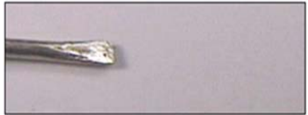
1B. Cutting the tube actually closes the end.